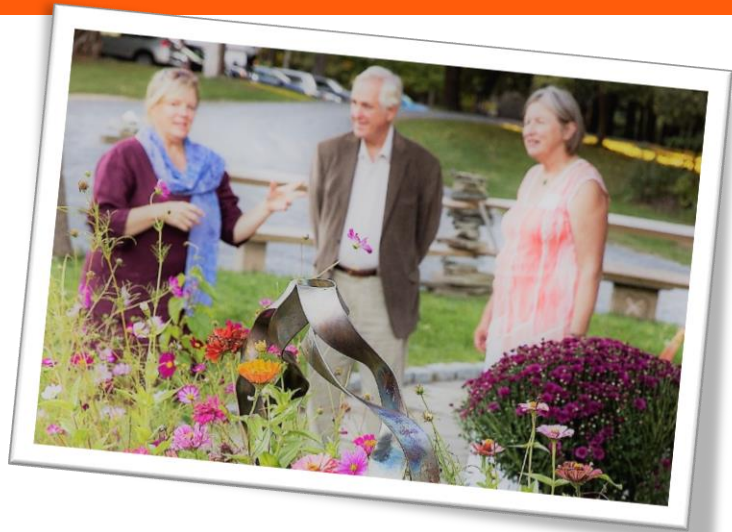
VISION: Tompkins County thrives thanks to engaged philanthropy