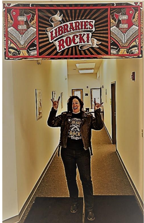
Summer Reading 2018 Libraries ROCK

“This grant provides the necessary means to which we require to run the Ready, Set, Read! early literacy program. Due to this grant's funding, our Ready, Set, Read! program has become very successful in providing not only a program from which children can learn their letters, letter sounds and beginning steps towards reading, but also a way in which caregivers are shown the importance of early literacy and ways they can further institute these skills at home with their children. Grant funds also make it possible for each child to take home a book of their very own to have for their own library. This gives them a sense of ownership furthering helping in their reading success . Additionally the families that have attended the Ready, Set, Read! program have become frequent users of the Cortland Free Library and have attended other programs offered here.”