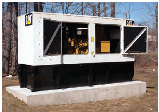
(Upper): Foodnet volunteer and guests; (lower): Foodnet power generator