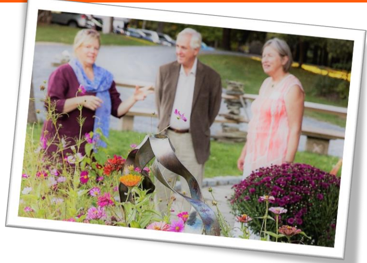
VISION: Tompkins County thrives thanks to engaged philanthropy