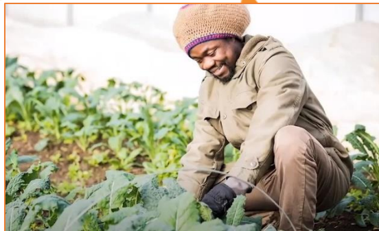
COVID-19 Response Fund Grantee: Healthy Food For All (photo provided)