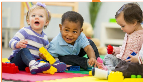
2021 Resilient Communities Grantee: Child Development Council

Details and grants listing: www.cftompkins.org