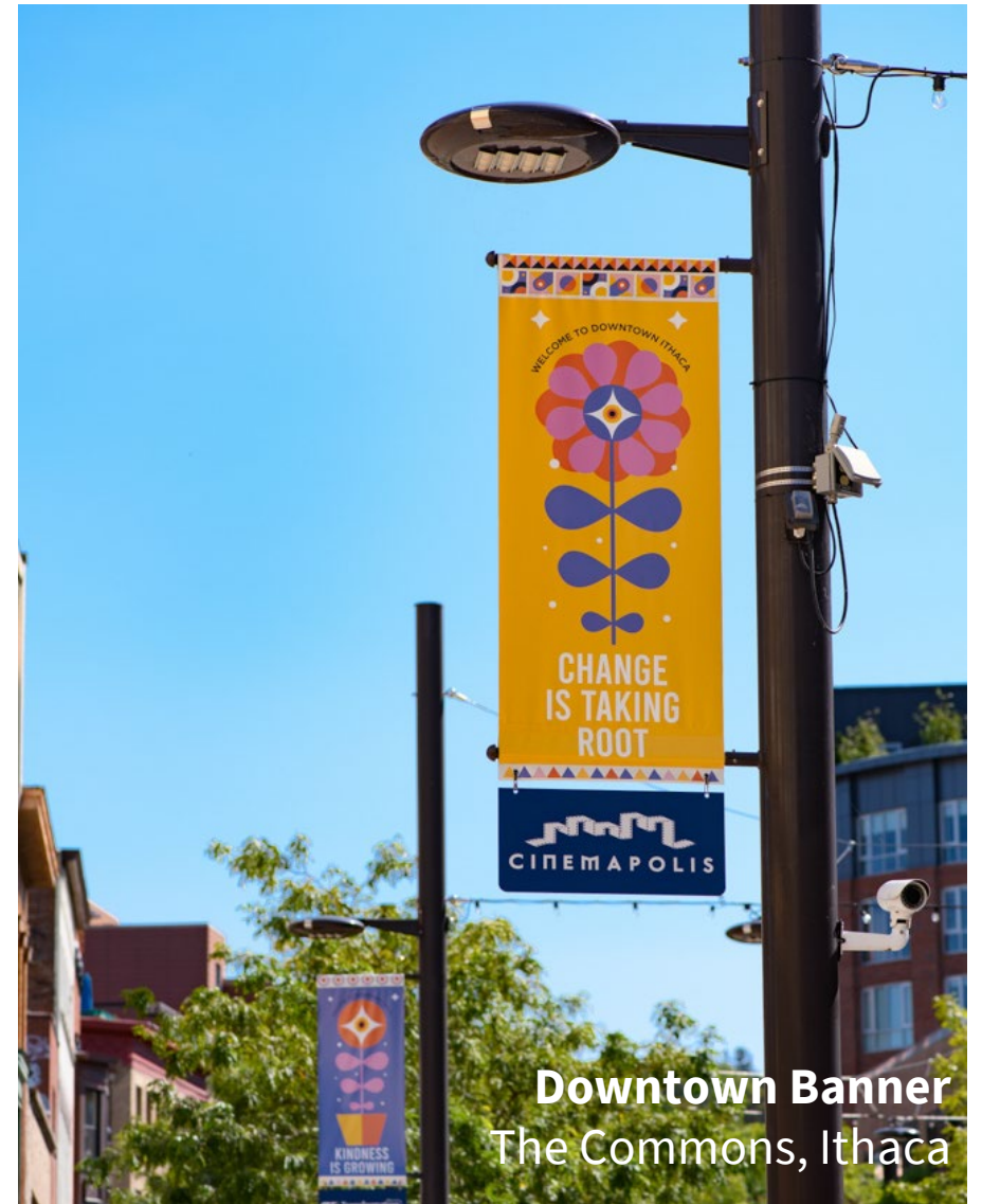
Downtown Banner The Commons, Ithaca