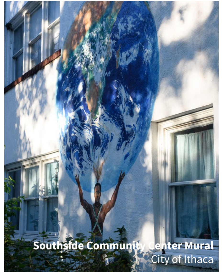
Southside Community Center Mural City of Ithaca